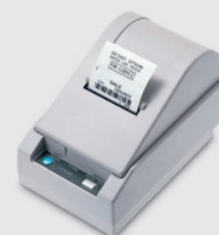
TM-L60 II Label printer

For further information please contact your local Epson office or visit www.epson-europe.com