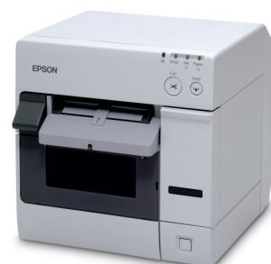
TM-C3400 colour label printer

Besides a large product range of inkjet printers, Epson also offers thermal label printers for the commercial trade and service sectors.