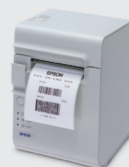
TM-L90 Label printer

Besides a large product range of inkjet printers, Epson also offers thermal label printers for the commercial trade and service sectors.